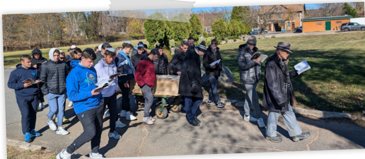
Davis Renov Stahler Yeshiva High School for Boys (DRS), Woodmere, NY