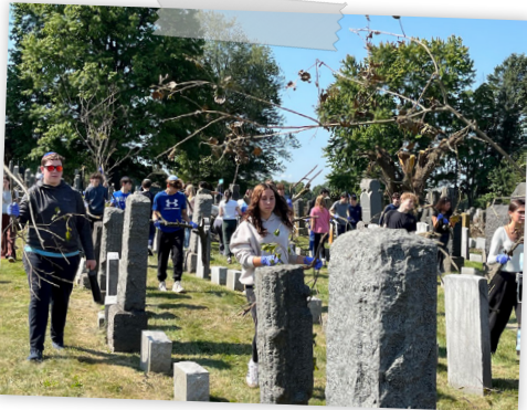
The Leffell School | Hartsdale, NY

Students from area schools participated in the fall/winter Cemetery Clean-Up Project at HFBA's Mount Richmond Cemetery. The chesed project has been a longstanding volunteer event that gives young people the opportunity to honor fellow Jews who left this world without the resources for a traditional Jewish burial. ■