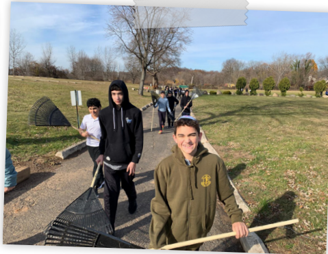
Rosenbaum Yeshiva of North Jersey River Edge, NJ