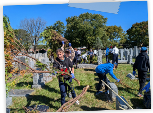
Yeshiva of South Shore, Yeshiva Toras Chaim Hewlett, NY