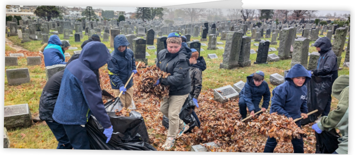
Adolph Schreiber Hebrew Academy of Rockland (ASHAR), New City, NY